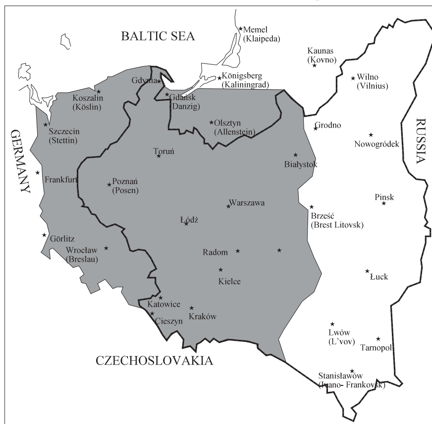
INDEPENDENT POLAND, 1921-1939, After World War II, the borders of Poland shifted west, taking parts of Pommern and Brandenburg and giving up parts of Grodno, Volhynia, and Vilna to Russia.